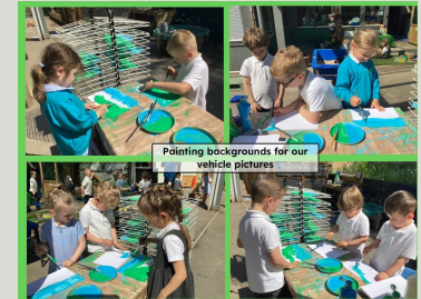
Painting backgrounds for our vehicle pictures